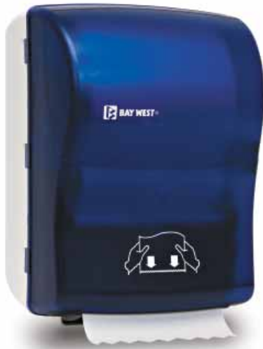
86500 / 76500

Available in five translucent colors: Black, Green, Red, White, and Blue Also available with stainless finish as part of the Elegance Series™ line of dispensers