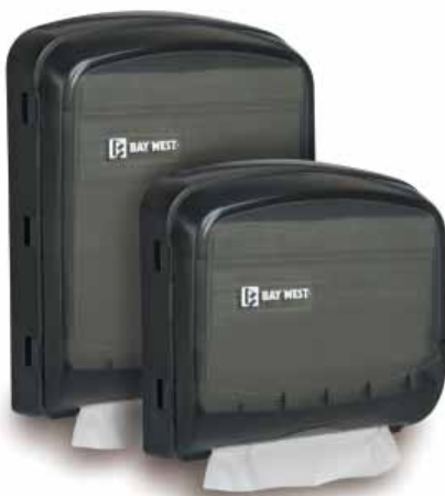
53500 / 53200

Available in five translucent colors: Black, Green, Red, White, and Blue Also available with stainless finish as part of the Elegance Series™ line of dispensers