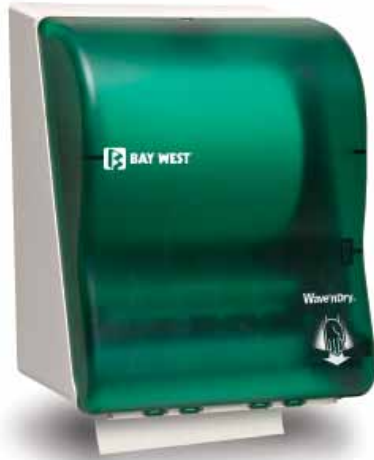
80010 / 75010