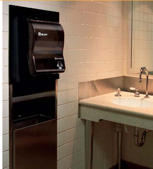
The Wave'n Dry is smaller than many competitive touch free dispensers, making it ideal for applications where wall space is a consideration.